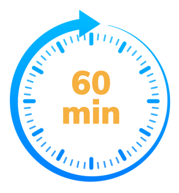
Typical PSG Studies = 1 hour

Before EnsoSleep: 60 to 75 Minutes per PSG